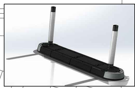
DETAIL 1: TRAFFIC ISLAND 400mm WIDE x 2500mm LONG (TYPICAL ARRANGEMENT)