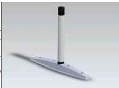
DETAIL 2: CYCLE LANE SEPARATOR 175mm WIDE x 1000mm LONG (TYPICAL ARRANGEMENT)