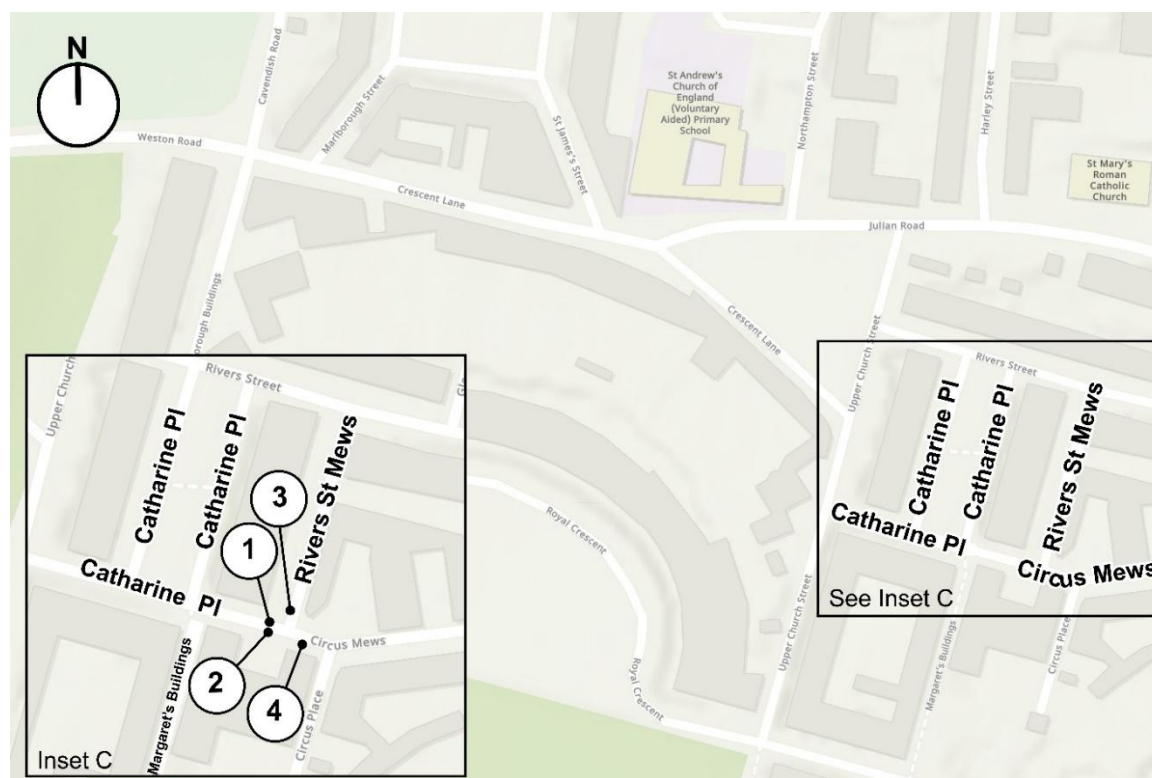
Figure 1: Catharine Place ETRO Trial Details