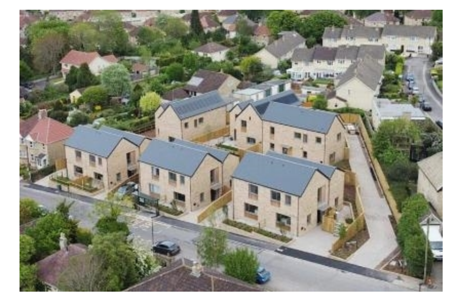
Sladesbrook development, part of B&NES Homes' portfolio