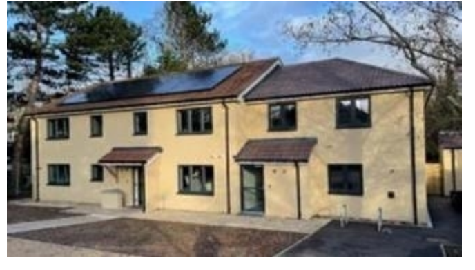
Theobald House, designed to Passivhaus standard.