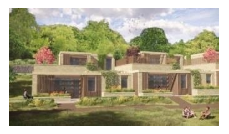
Englishcombe Lane, 16 units of specialist LD accommodation.