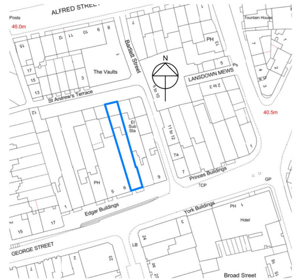
LOCATION PLAN - Scale 1:1250