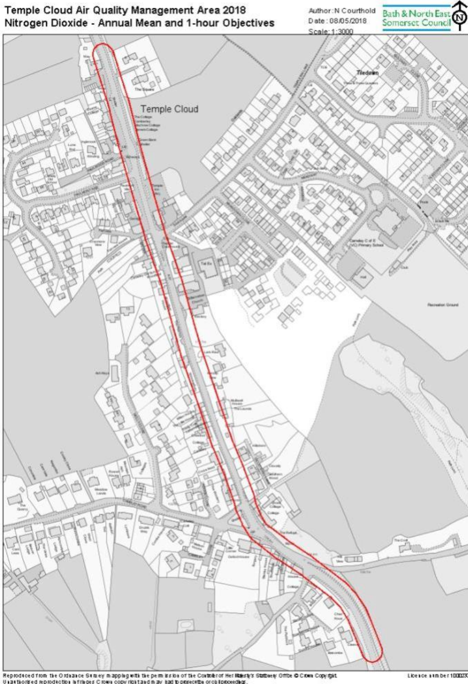
Figure 1.1 Temple Cloud – Air Quality Management Area Boundary

Bath and North East Somerset Council has a statutory obligation under Part IV of the Environment Act 1995 to review and assess air quality within their area. Following a review of the air quality across the authority, areas within the villages of Temple Cloud and Farrington Gurney on the A37 were identified as exceeding the National Air Quality Objectives for Nitrogen Dioxide (NO 2 ) concentrations. As a result, the Council declared Air Quality Management Areas (AQMAs) for the areas of exceedance in these locations. As might be expected, the exceedances occur on the main A37 passing through each settlement. Figure 1.1 and Figure 1.2 show the AQMA extents in each case. Both AQMA areas came into force on the 20 th August 2018.