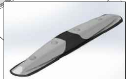
DETAIL 3: CYCLE LANE SEPARATOR 120mm WIDE x 720mm LONG (TYPICAL ARRANGEMENT)