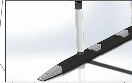
DETAIL 2: CYCLE LANE SEPARATOR 175mm WIDE x 2500mm LONG (TYPICAL ARRANGEMENT)