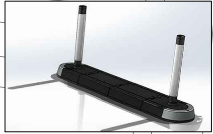
DETAIL 1: TRAFFIC ISLAND 400mm WIDE x 2500mm LONG (TYPICAL ARRANGEMENT)