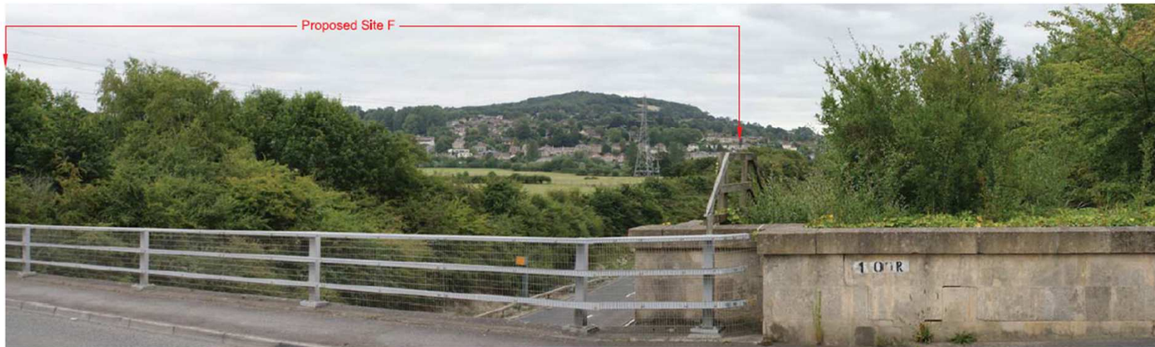
Key Viewpoint 2. View north east towards proposed Site F from Mill Lane bridge over the A4