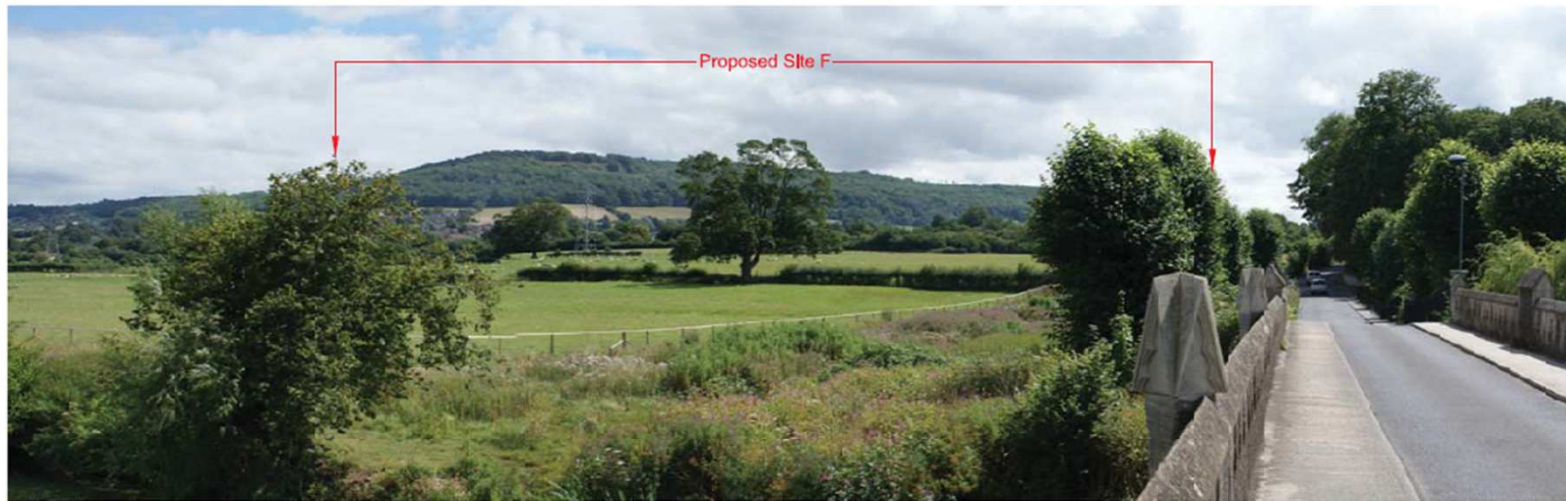
Key Viewpoint 1. View south east towards proposed Site F from Mill Lane toll bridge over the River Avon