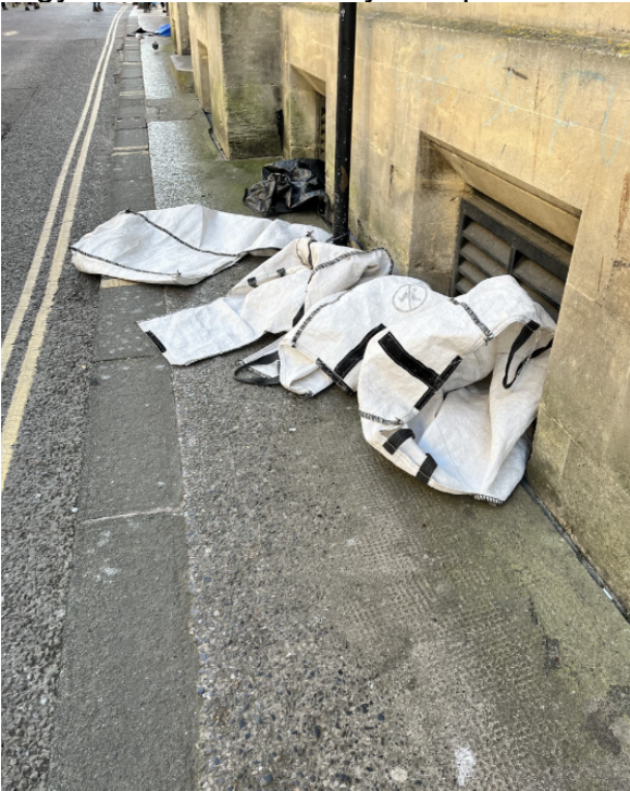
Argyle Street – Saturday 19 April 25