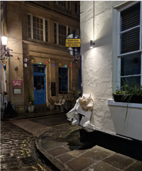
Queen Street – 19/04/25