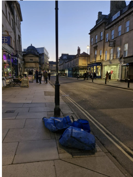
Westgate Street – 19/04/25